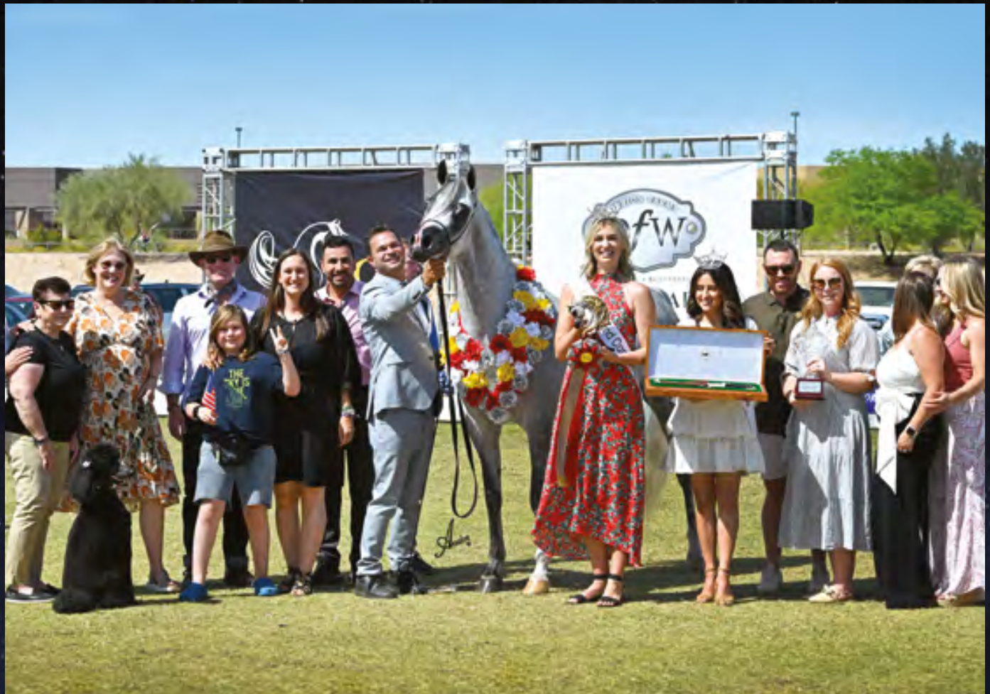
SILVER CHAMPION OM EL BELASINA (OM EL SINON X OM EL BELADEENA) BREEDERS/OWNERS: OM EL ARAB INTERNATIONAL

Mirroring the depth of quality in both the Yearling and Junior Fillies, the competition for Senior Mares was highlight of the entire show, with magnificent matrons bred on four continents brought forward for assessment. Two homebred beauties with international connections, however, held their own in the Top Ten line-up, finishing in Bronze and Silver medal positions. The ethereal Peacemaker-bred MARBELLA PCF (Exxalt x Verietta PCF by PCF Vision), fresh off her Silver Championship in Scottsdale International competition, was named Supreme Bronze Champion for Arabian Soul Partners of Mexico. Just ahead as Supreme Silver Champion, was a young mare hailing from one of the most globally renowned and accomplished breeding programmes of the last six decades, that of Om El Arab International, a name synonymous with classic Arabian type and beauty.