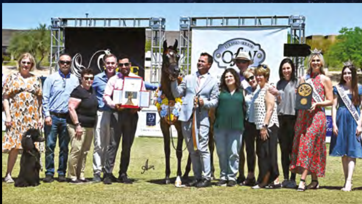
BRONZE CHAMPION VISION OF LOVE ENB (DOMINIC M X SYMPHONY OF LOVE) BREEDERS/OWNERS PSYNERGY ENTERPRISE DEVELOPMENTS LLC